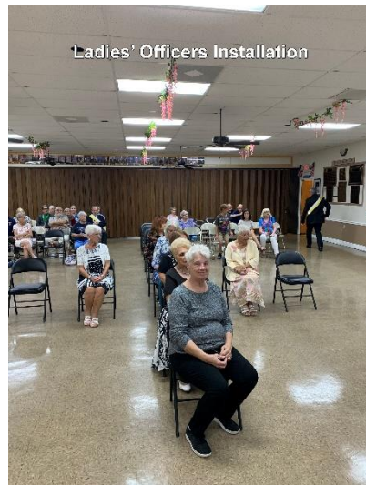
Ladies' Officers Installation